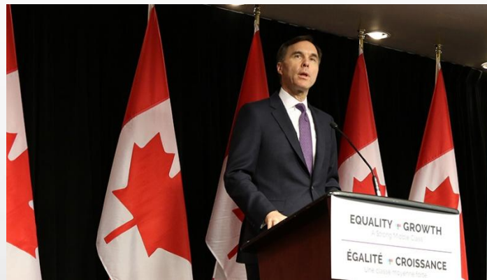
The Honourable Bill Morneau, Minister Finance, Canada

2018 Canadian Government Budget centres on an argument that women will be crucial to economic growth in the coming years.